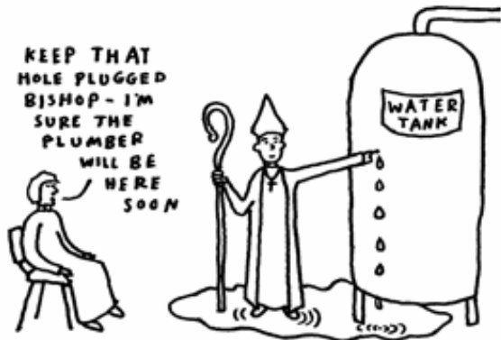
RESPOND TO CRISES WHEN THEY OCCUR