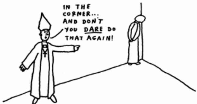
DISCIPLINE THE CLERGY