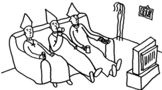
SIT IN THE HOUSE OF BISHOPS